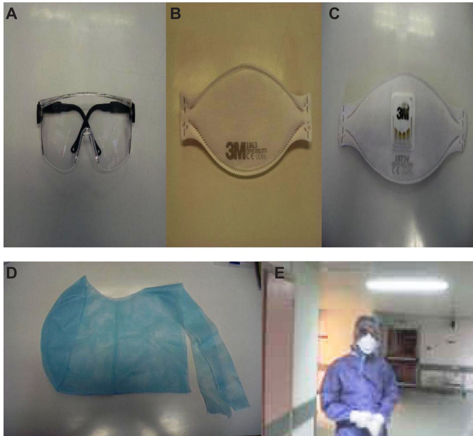
Figure 2 Protection measures: (A) protective glasses, (B) 3M™ protective mask without micro filter, (C) 3M™ protective mask with micro filter, (D) protective cup, (E) protective clothing.