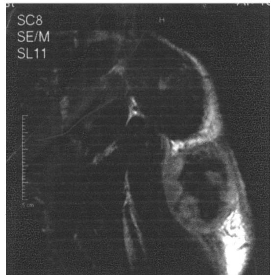
Fig. 1. A magnetic resonance T1-weighted image showing a well-defined solid tumour with slightly hyperintense periphery and hypointense centre, in contact with the deltoid and the triceps muscles, that was histologically proven to be a grade III leiomyosarcoma.

mately 5 x 6 cm 2 when he was seen in clinics 4 months later (Fig. 1). The mass was hard, firmly attached to the surrounding tissues and mildly painful at palpation, and the overlying skin was warm and